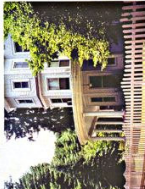
8. Mann House