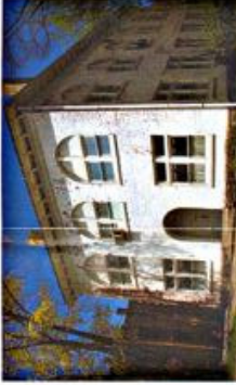
16. Masonic Temple