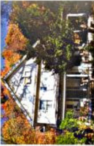
10. Pack House

Group Tours Available for 20 or more. Contact: (304) 248-8381