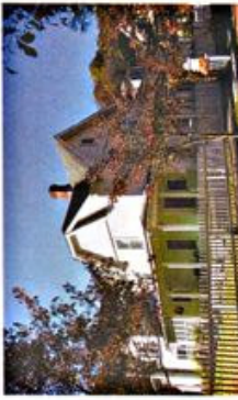
12. Meyers House