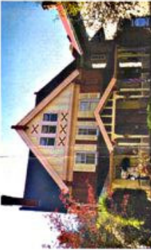
14. Perry House