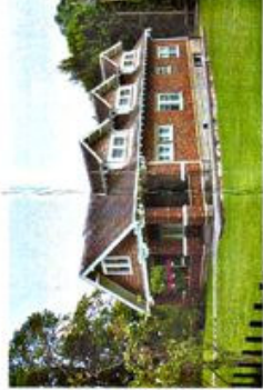
2. Honeymoon Cottage