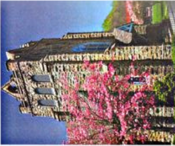
4. Bramwell Presbyterian Church