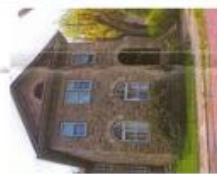
15. Bank of Bramwell