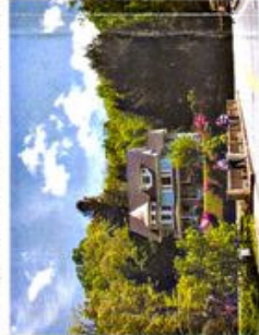
5. Goodwill House