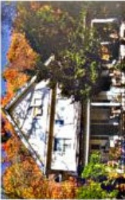
10. Pack House