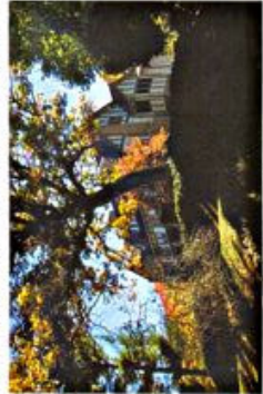
6. Thomas House