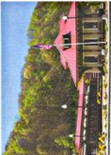
1. Coal Heritage Center