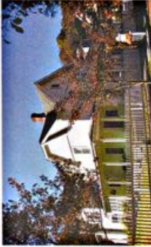
12. Meyers House