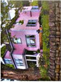
7. E.S. Baker House