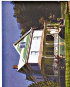
9. Keller-Pritchard House