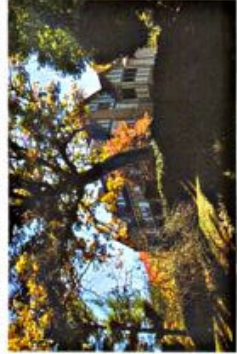
6. Thomas House