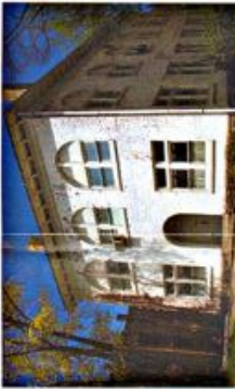
16. Masonic Temple