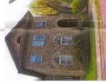
15. Bank of Bramwell