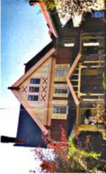
14. Perry House