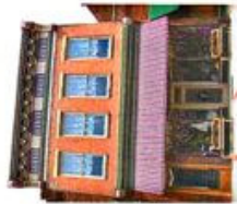
18. Victorian Elegance