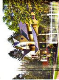
13. Collins House

Group Tours Available for 20 or more. Contact: (304) 248-8381