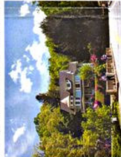
5. Goodwill House

Group Tours Available for 20 or more. Contact: (304) 248-8381