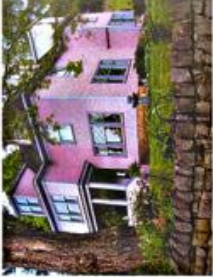
7. E.S. Baker House