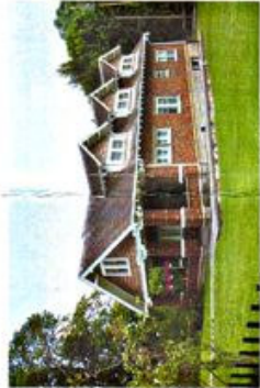
2. Honeymoon Cottage