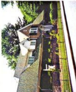
11. Hewitt House