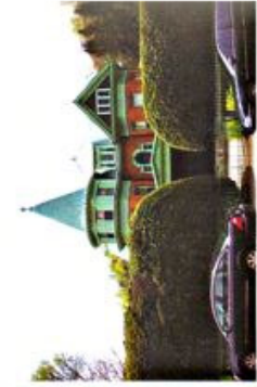
3. Cooper House