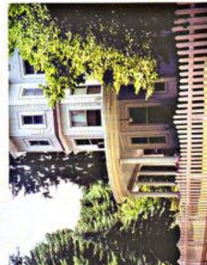
8. Mann House

Group Tours Available for 20 or more. Contact: (304) 248-8381