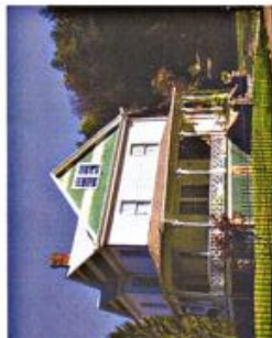
9. Keller-Pritchard House