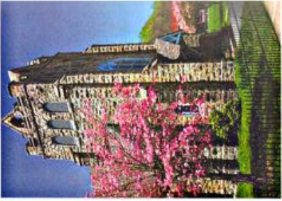
4. Bramwell Presbyterian Church