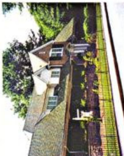
11. Hewitt House