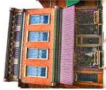
18. Victorian Elegance